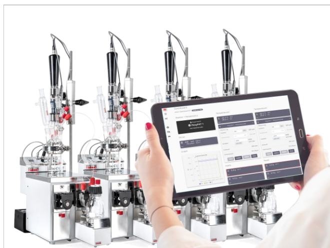
Chart 2: RemoteX with FlexyCUBE