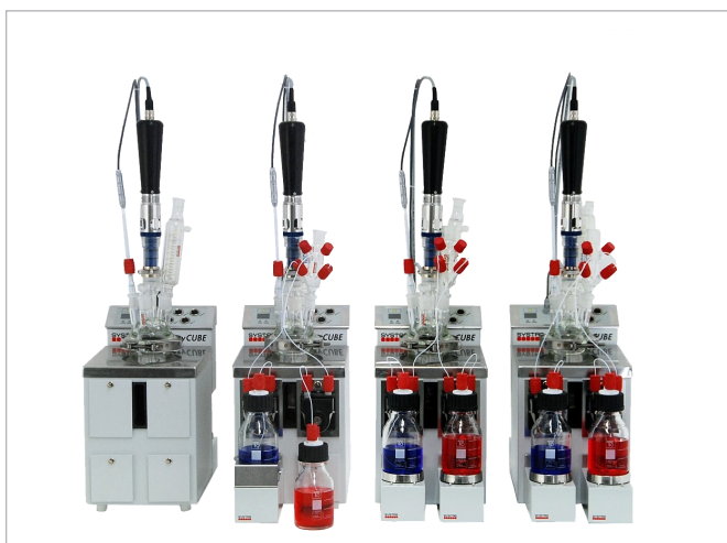
FlexyCUBE - Parallel Synthesis Workstation

FlexyConcept from SYSTAG provides a uniquely integrated solution with all data available across the process and able to be displayed at the click of a mouse in a single chart, whether from milliliter or kilo-gram scale.